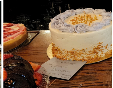
Desserts by donation