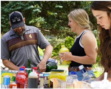
Bubbly in the garden