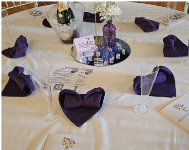
Ready for brunch