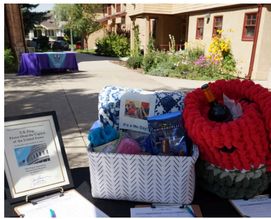
Silent auction items